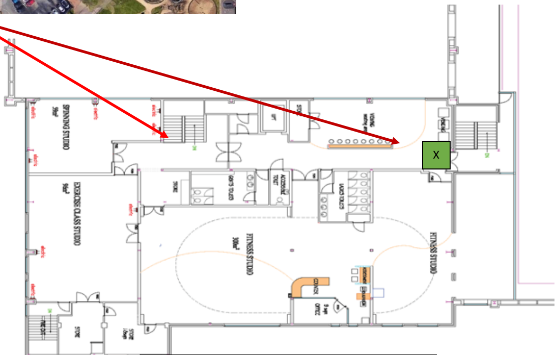
First Floor of Sports Centre